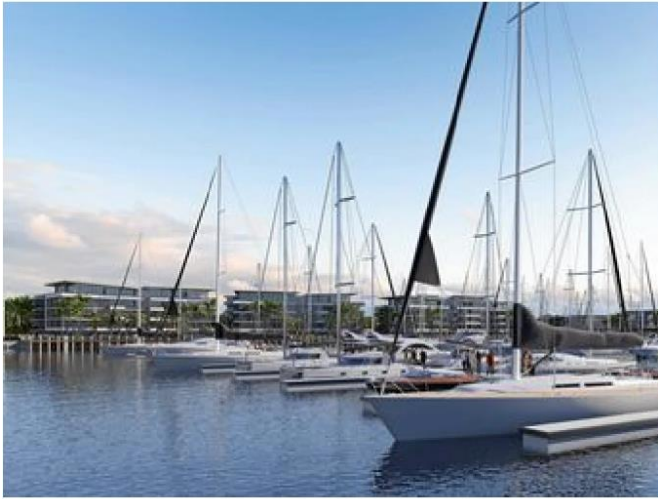
The development includes a 318-berth marina and a 24-hour fuel dock.

“We are very excited to see this project back on the drawing board as it will deliver on transforming an underused resource of the region into a vibrant regional community providing much needed employment for Bundaberg,” he said.