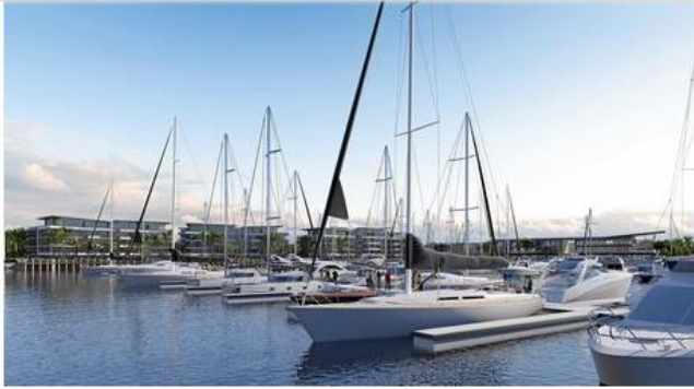
📷 The development includes a 318-berth marina and a 24-hour fuel dock.