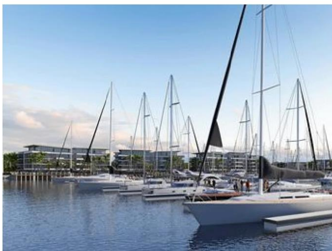
The development includes a 318-berth marina and a 24-hour fuel dock.

“We are very excited to see this project back on the drawing board as it will deliver on transforming an underused resource of the region into a vibrant regional community providing much needed employment for Bundaberg,” he said.