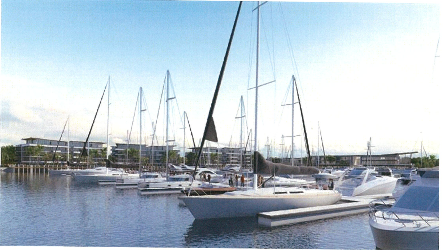
Gateway Marina - Burnett Heads

Wide Bay's newest marina has launched an introductory offer that will guarantee boaties a range of benefits - including discounted berthing rates - from the moment it opens later this year.