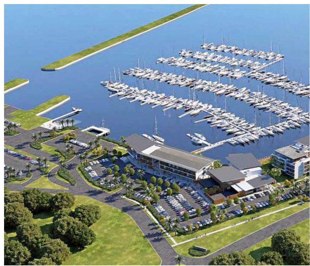
BIRTH OF AN ERA: Artist's impression of the Gateway Marina at Burnett Heads.