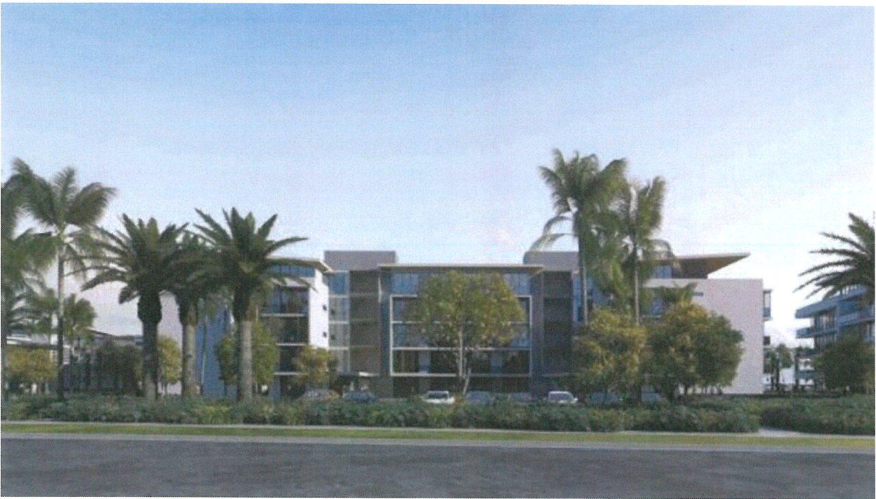
MAKING WAVES: Plans for the Gateway Marina in the recent Bundaberg Regional Council ordinary meeting.

"I think Burnett Heads' time has come," he said.