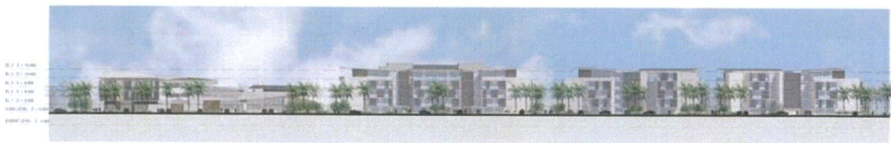
STREETSCAPE 01 VIEW FROM HARBOUR ESPLANADE LOOKING NORTH EAST