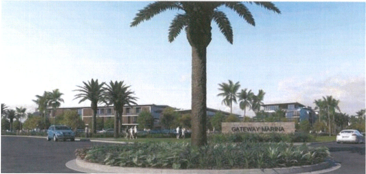
MAKING WAVES: Plans for the Gateway Marina in the recent Bundaberg Regional Council ordinary meeting.