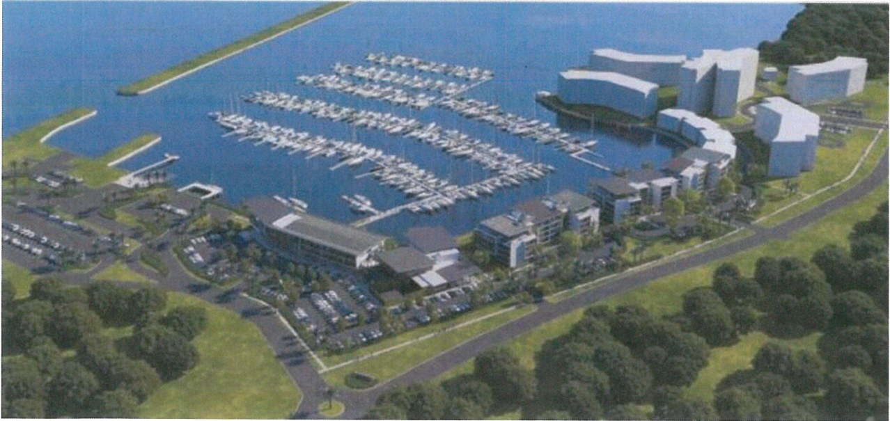
MAKING WAVES: Plans for the Gateway Marina in the recent Bundaberg Regional Council ordinary meeting.