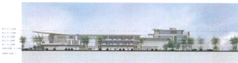
STREETSCAPE 02 VIEW FROM HARBOUR ESPLANADE LOOKING NORTH EAST