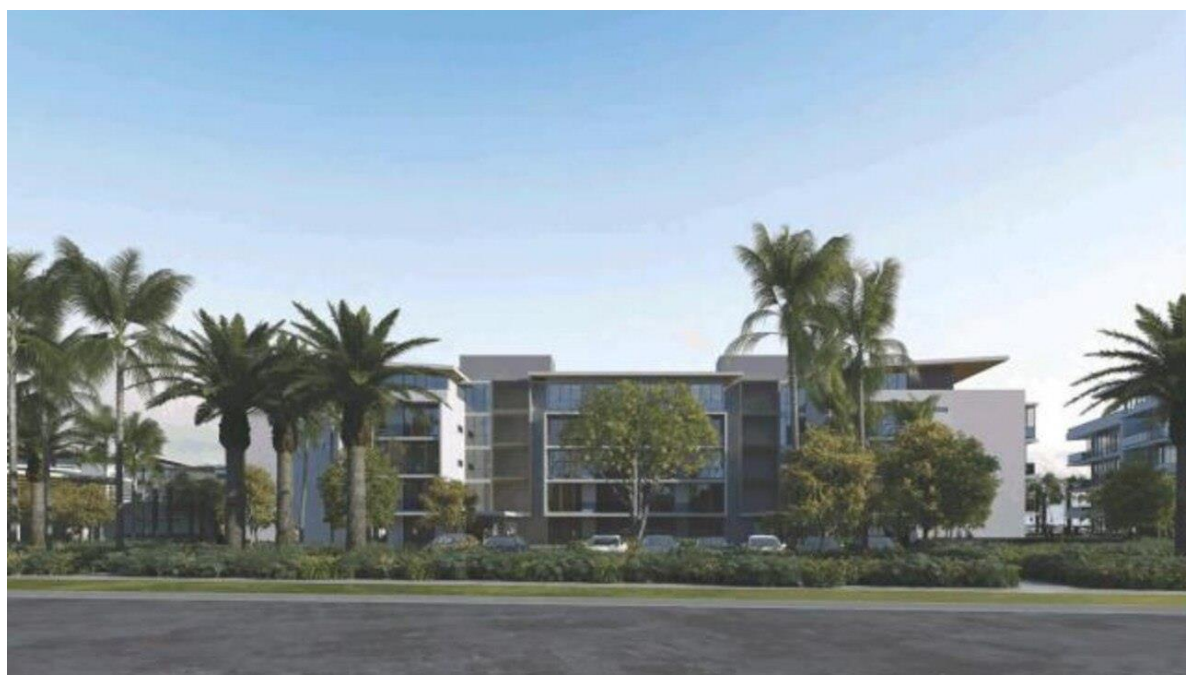
MAKING WAVES: Plans for the Gateway Marina in the recent Bundaberg Regional Council ordinary meeting.

"There has also been strong enquiry for both apartment sales and retail spaces to lease."