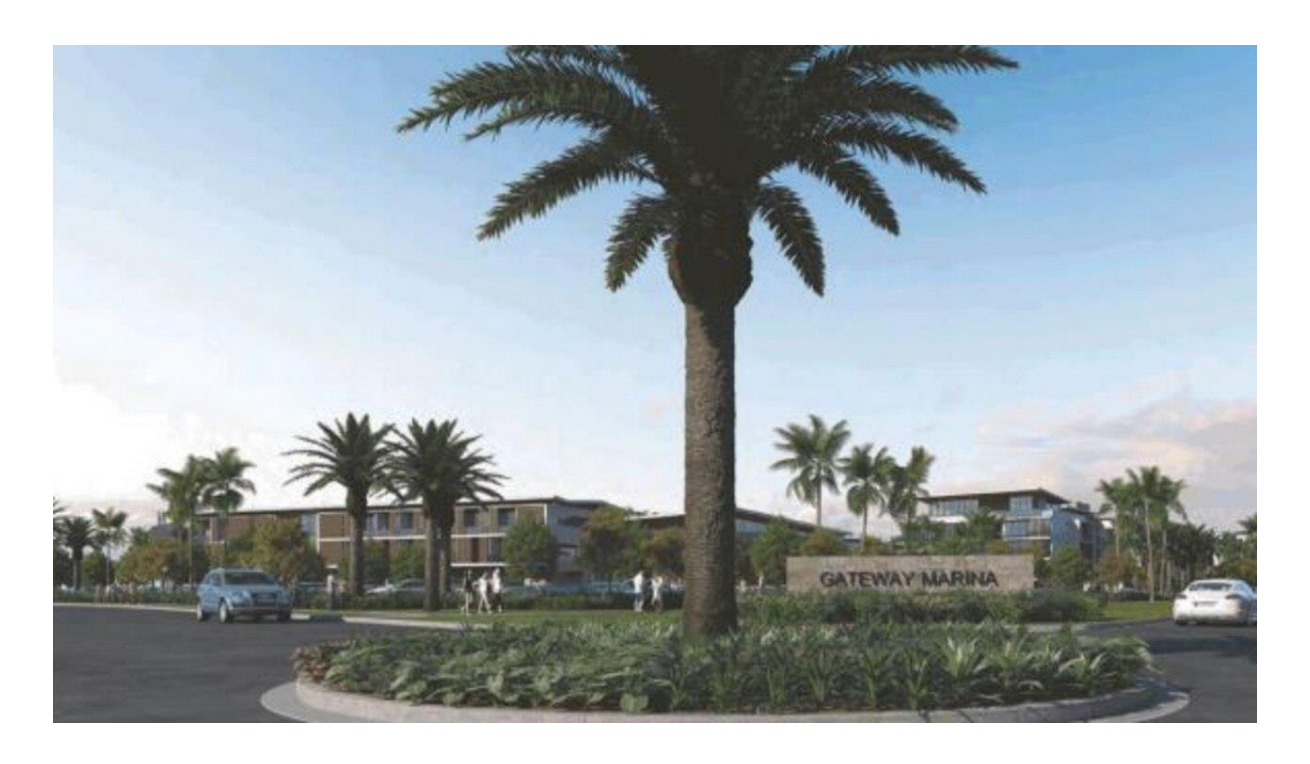
MAKING WAVES: Plans for the Gateway Marina in the recent Bundaberg Regional Council ordinary meeting.

Should the project stay on its current course, on-land work could start early next year.