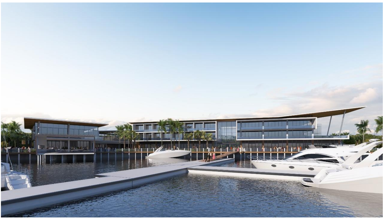
Artist impressions for The Gateway Marina at Burnett Heads.