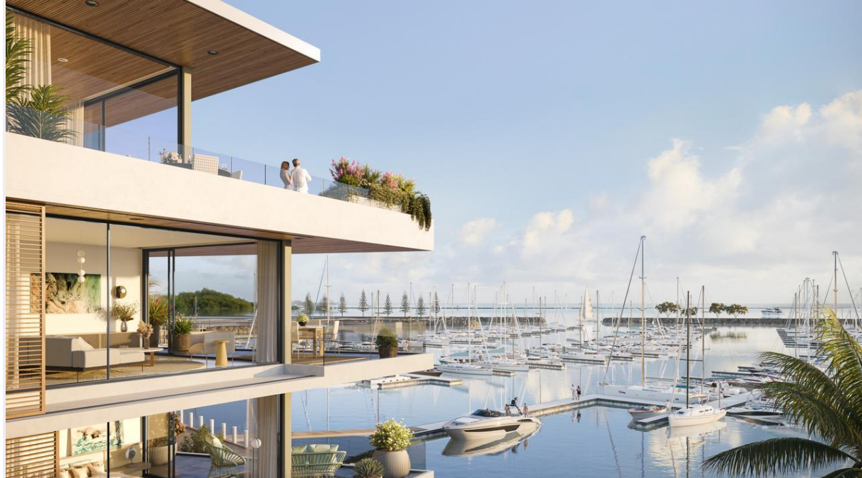
An artist's impression of the Gateway Marina project in Burnett Heads, near Bundaberg.

The Gateway Marina project will be the first and major high-quality mixed-use marina and residential development in little-known Burnett Heads, near Queensland's Bundaberg.