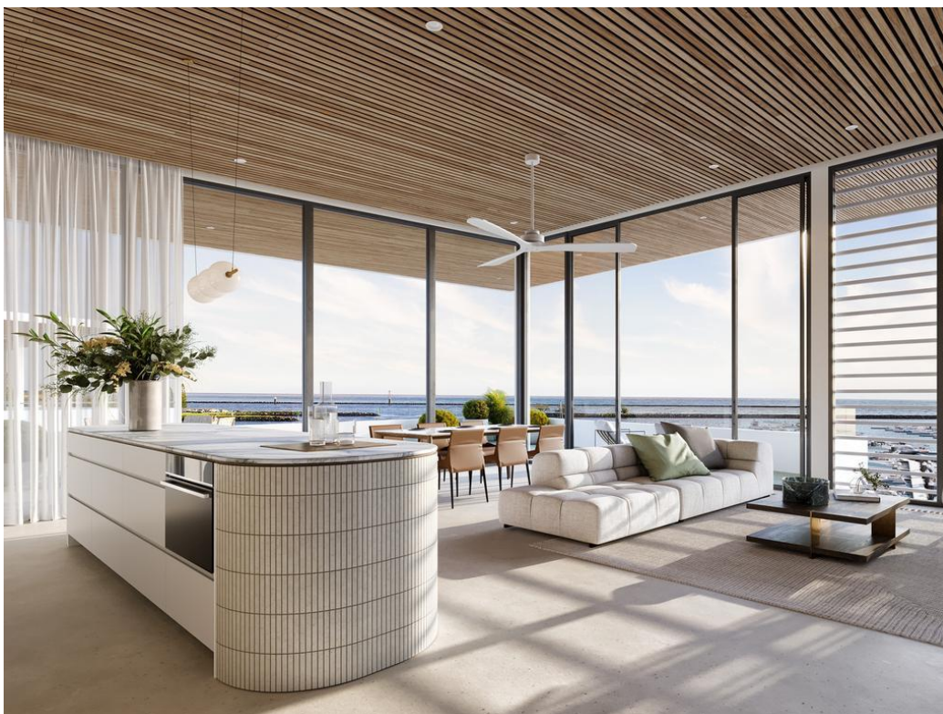
The Gateway Marina is set to offer a luxury experience that Bundaberg has never seen before.