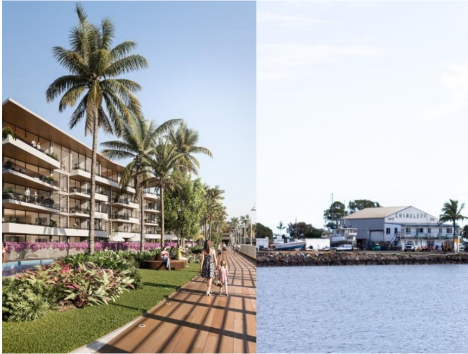
THEN AND NOW: A side by side of proposed artist's impression of the new Gateway Marina and existing Burnett Heads visage.