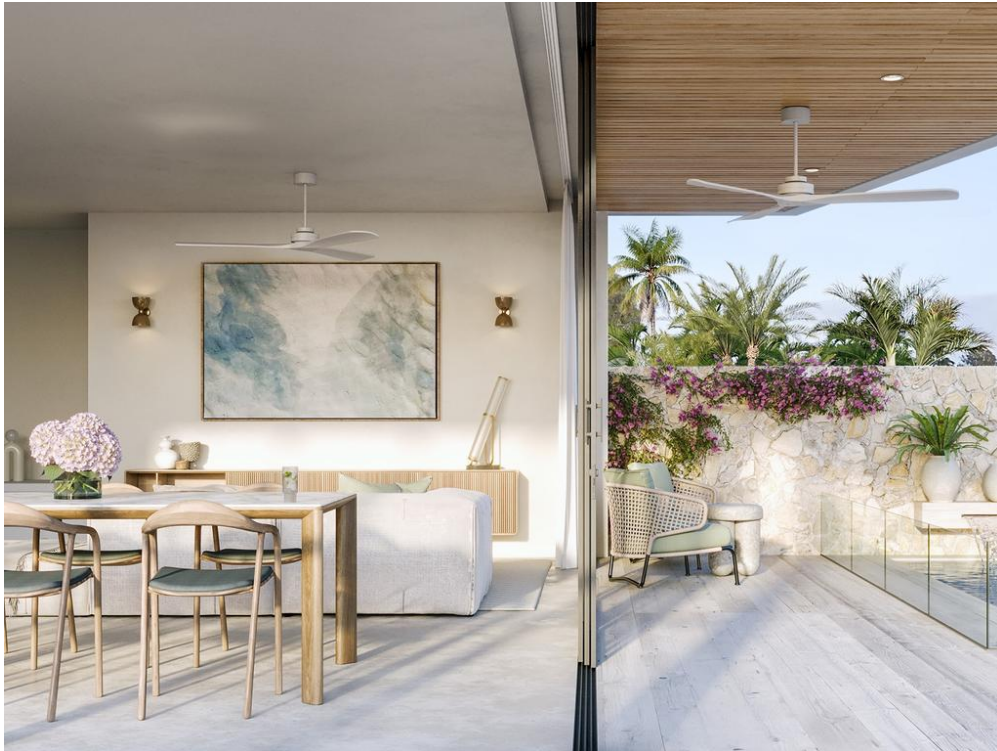
Further artists impressions of the proposed Gateway Marina apartments.