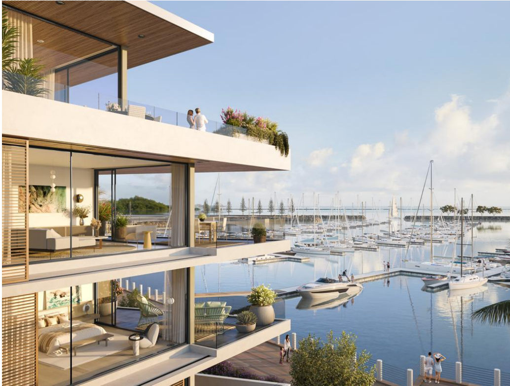
Gateway Marina artists impressions show a spectacular view from the proposed apartments over the marina.