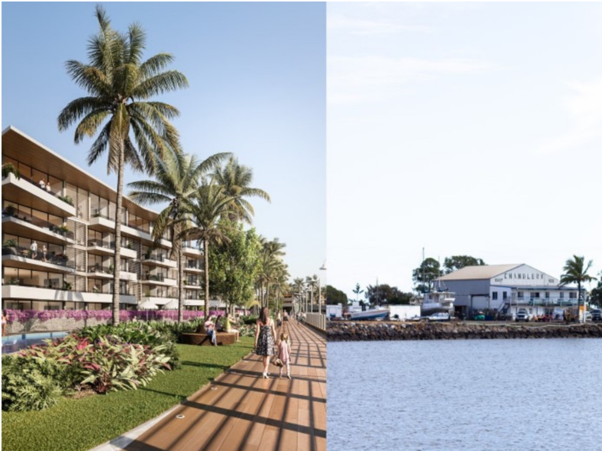
THEN AND NOW: A side by side of proposed artist's impression of the new Gateway Marina and existing Burnett Heads visage.