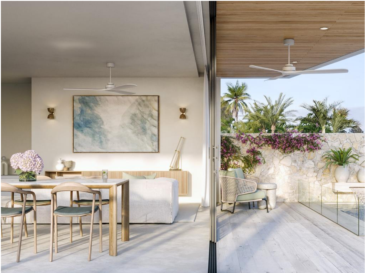
Further artists impressions of the proposed Gateway Marina apartments.