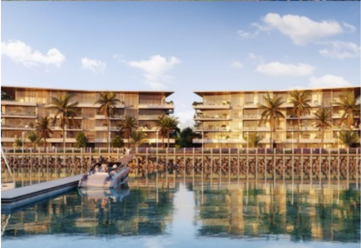
Work has begun on the new Gateway Marina, with an artist's impression showing the future development design.