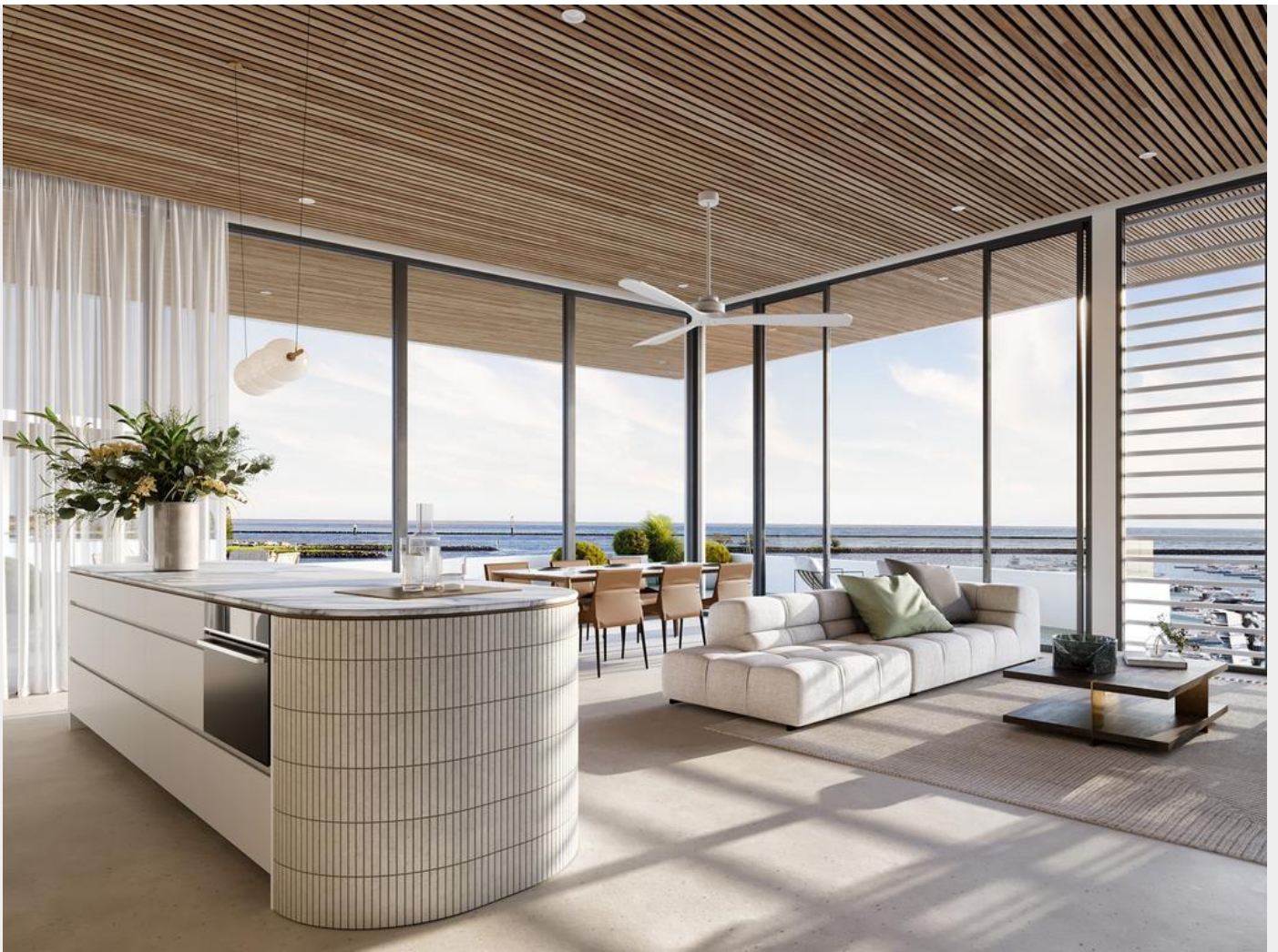
Gateway Marina artists impressions.

“The market response to The Gateway Waterfront Residences has been incredible. We knew we had something special on our hands here, and we have really seen a lot of genuine interest.